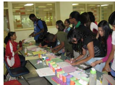
STAR School Outreach Event

We acknowledge the Avon Foundation, County of Westchester, Elizabeth Butler Angel Foundation, Ronald McDonald House Charities, TJJ Foundation, the Women of St. Matthew's and our donors for their support of our teen dating abuse program.