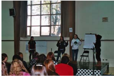
White Plains HS STAR leaders empower teens with knowledge about abuse.

The cornerstone of our teen dating abuse program is the knowledge that young victims of abuse are reluctant to reveal the abuse to adults. Our program empowers young people with the knowledge they need to help themselves, to give each other good advice and, ultimately, to stem the tide of teen dating abuse.