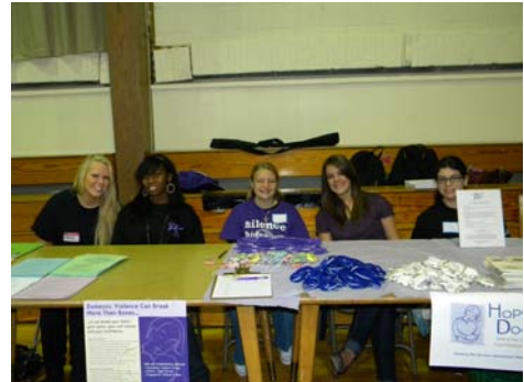
STAR Peer Leaders staff a table at symposium.

Alexander Hamilton HS Hendrick Hudson HS Pleasantville at Hope's Door Maria Regina HS Rye High HS Westlake HS White Plains HS